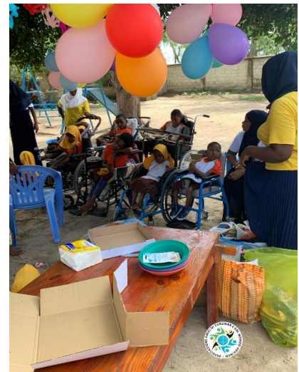
RAMADAN GIFT DELIVERY

After Ramadan, educational and recreational activities continue for the nursery, school activities for the kindergarten in English and Swahili, with outdoor recreational activities for the nursery and craft and drawing activities for the older children.