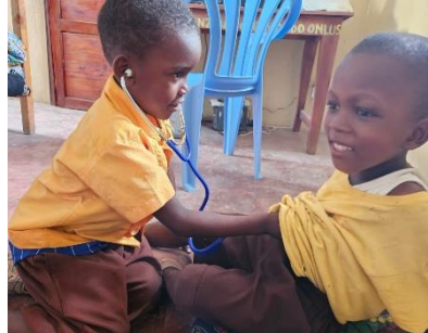
HOSPITAL MEDICAL VISITS