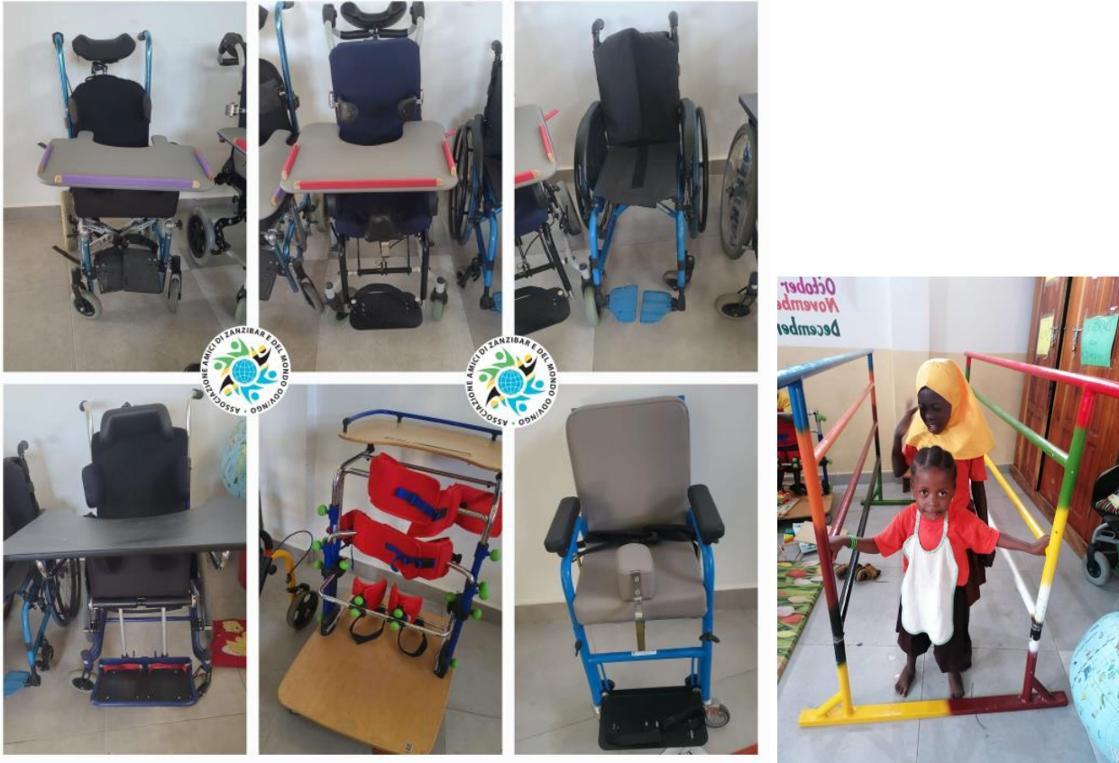
CARRIAGES, STANDING, HIGHCHAIR, PARALLEL BARS

Association "Amici di Zanzibar e del Mondo NGO" Kumba Urembo Kiwengwa Zanzibar Registration number Z0000014978 Government Zanzibar 24/12/2018 Registration TRA NGO TIN Number 140-498-330 Government Tanzania 04/02/2020 PO.Box. 885 Stone Town Simu +255699780323 Mobile whatsapp +393933098863