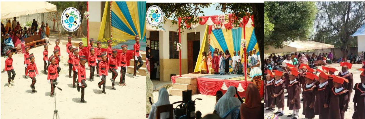
END OF SCHOOL YEAR RECITAL DECEMBER 2024

TOTAL EXPENSES INCURRED IN THE YEAR: TZS 115,417,759 / € 46,642.00