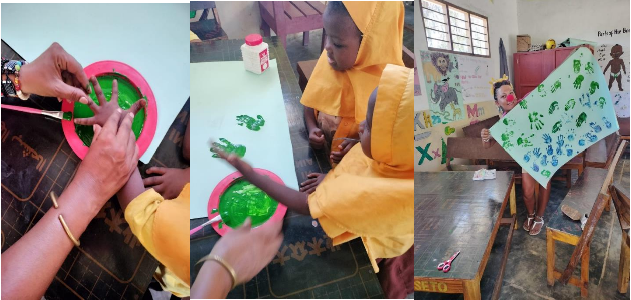
MANUAL ACTIVITIES CREATING A GROUP ALL TOGETHER

Association "Amici di Zanzibar e del Mondo NGO" Kumba Urembo Kiwengwa Zanzibar Registration number Z0000014978 Government Zanzibar 24/12/2018 Registration TRA NGO TIN Number 140-498-330 Government Tanzania 04/02/2020 PO.Box. 885 Stone Town Simu +255699780323 Mobile whatsapp +393933098863