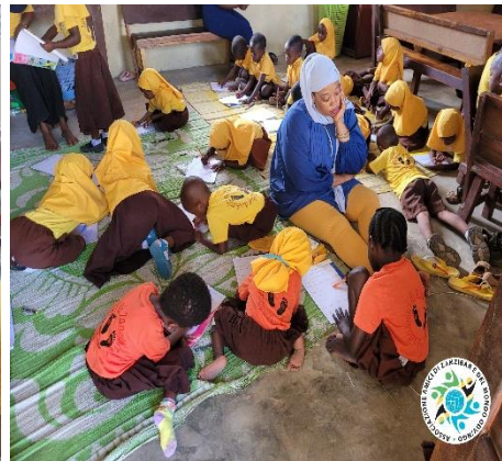
EDUCATIONAL ACTIVITIES WITH INCLUSION WITH CHILDREN FROM NURSERY AND KINDERGARTEN

Web site: www.amicidizanzibaredelmondo.org Facebook - Instagram: amicidizanzibaredelmondodv Pec: amicidizanzibaredelmondo@pcert.postecert.it E-mail: amicidizanzibaredelmondo@gmail.com