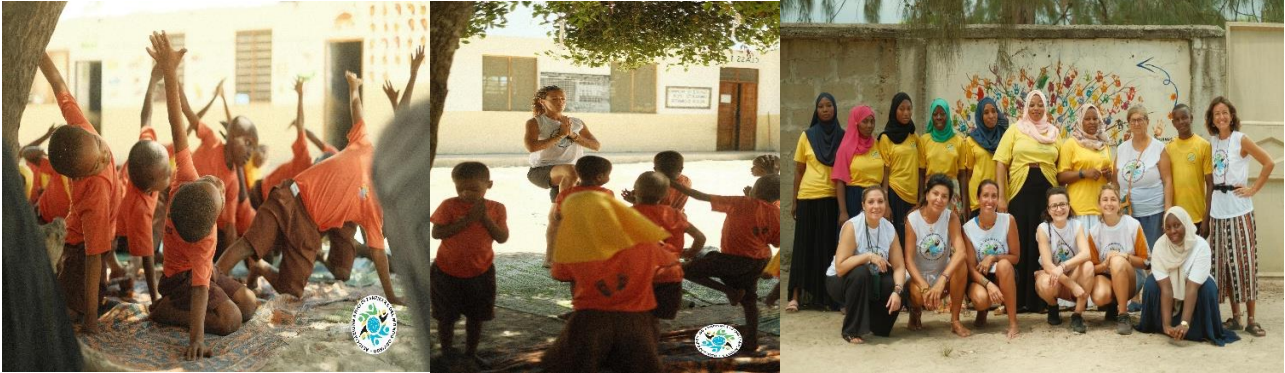
YOGA ACTIVITIES FOR OLDER CHILDREN

Association "Amici di Zanzibar e del Mondo NGO" Kumba Urembo Kiwengwa Zanzibar Registration number Z0000014978 Governement Zanzibar 24/12/2018 Registration TRA NGO TIN Number 140-498-330 Governement Tanzania 04/02/2020 PO.Box. 885 Stone Town Simu +255699780323 Mobile whatsapp +393933098863