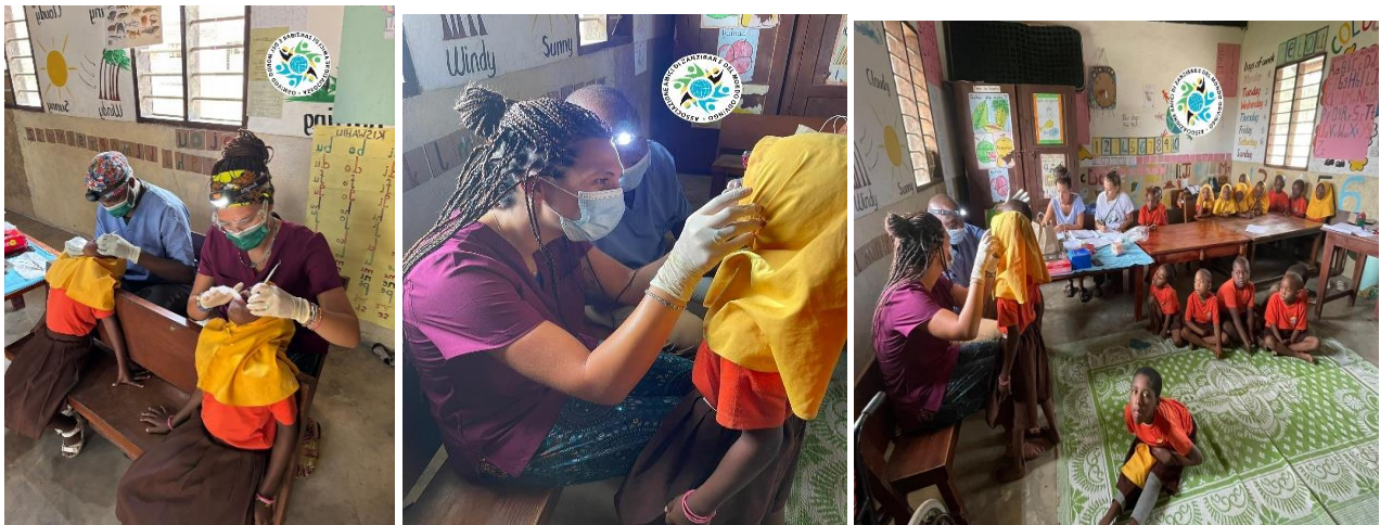
DENTAL VISITS AND TREATMENTS AUGUST 2024