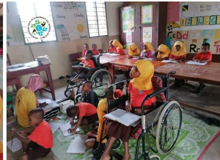
ENGLISH AND WRITING TEACHING ACTIVITIES WITH INCLUSION FOR THE DISABLED

Web site: www.amicidizanzibaredelmondo.org Facebook - Instagram: amicidizanzibaredelmondodv Pec: amicidizanzibaredelmondo@pcert.postecert.it E-mail: amicidizanzibaredelmondo@gmail.com